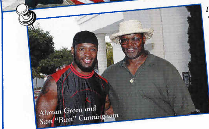
Ahman Green and Sam "Bam" Cunningham